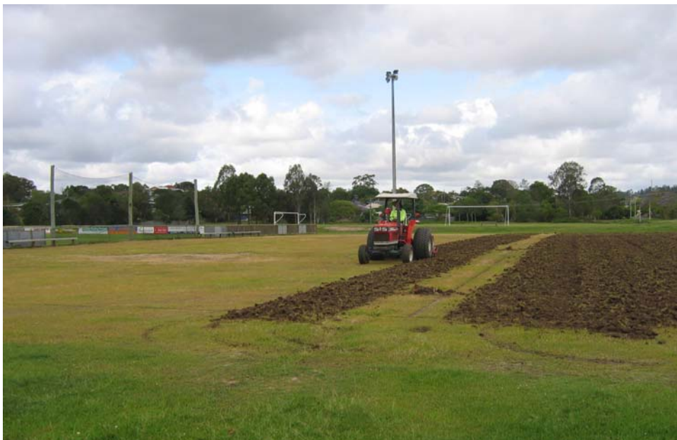
Field Renovations in progress.

In preparation for the end of the 2007 season we are submitting a grant application to the Brisbane City Council to replicate the renovations on fields 3, 4, 5 and 6.